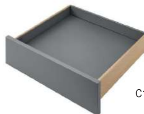
C198 Sierra oak reproduction