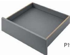
P198 Sierra oak reproduction