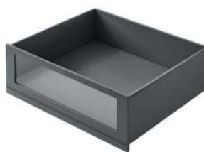
Optional for surcharge: Design glass panel Surcharge: MP-DGBLEN (7925)