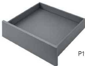
P194 Slate grey