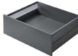
Internal pull-out with railing and glass side

Available with: • Wooden panel (standard) • Design glass panel Surcharge: MP-DGBLEN (7925)