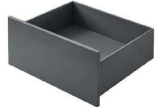
Internal pull-out with box

Available with: • Wooden panel (standard) • Design glass panel Surcharge: MP-DGBLEN (7925)