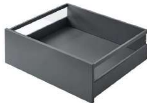
Internal pull-out with railing

Available with: • Wooden panel (standard) • Design panel Surcharge: MP-DBLEN (7935)