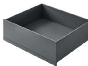
Optional for surcharge: Design panel Surcharge: MP-DBLEN (7935)