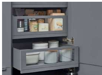
Design glass panel

The internal drawers and pull-outs come standard with a wooden panel. A design glass panel and a closed design panel made of plastic are available as alternative options.