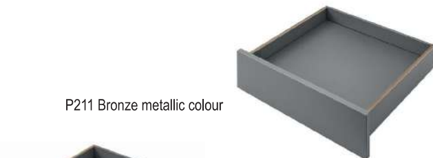
P211 Bronze metallic colour